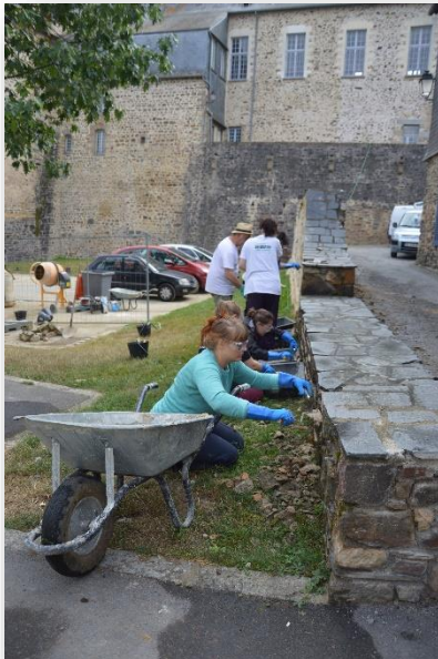
Restoring the wall next to the castle of Châteaugiron (2017)