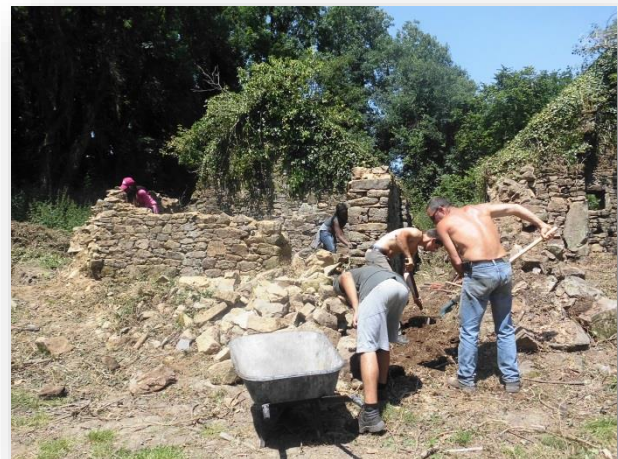
Conservation of the former weaver village of Keranflec'h, in Saint-Thégonnec (2015)